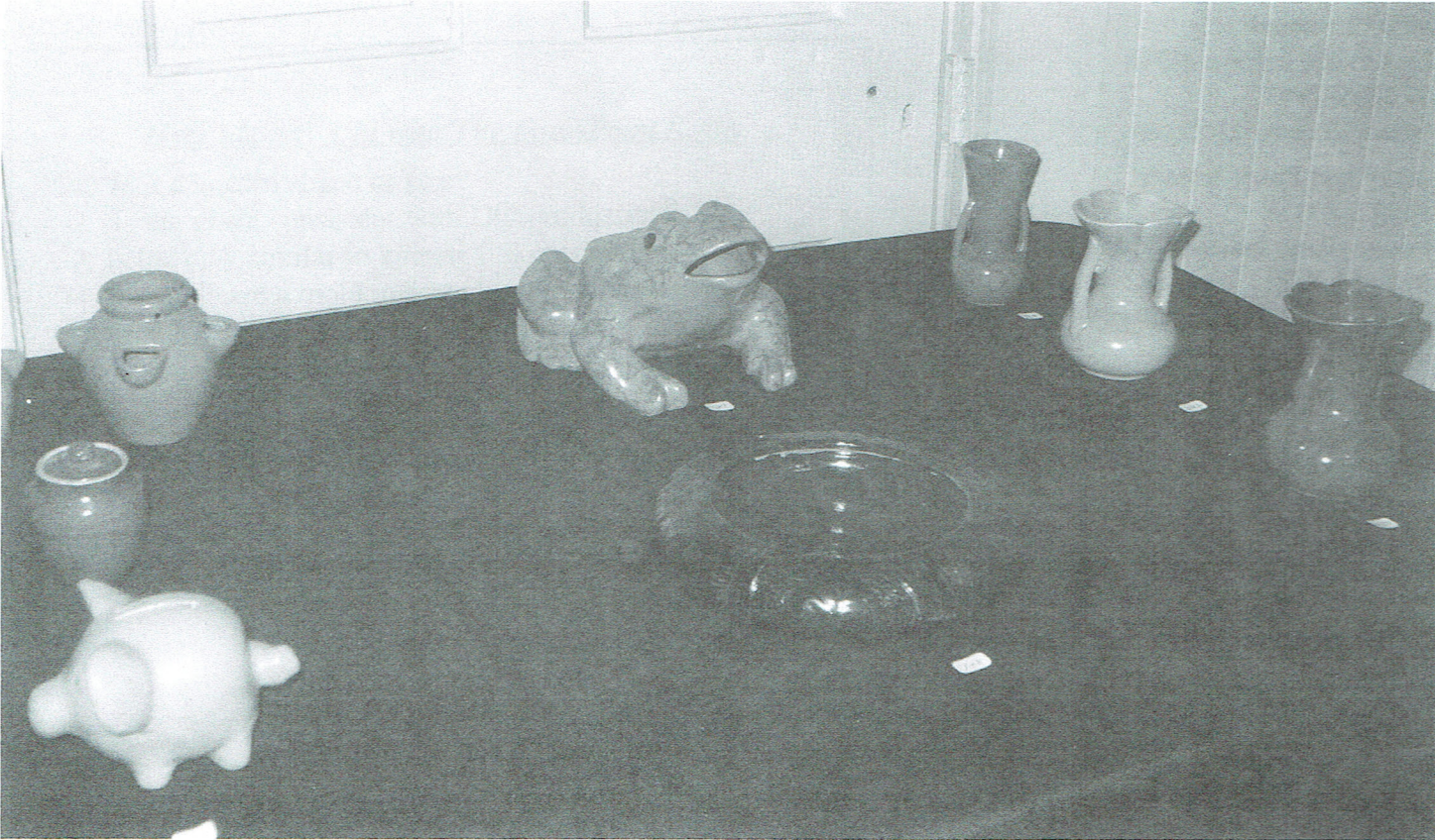
UHL Frog and Vases